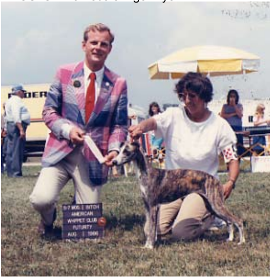
Judging AWC Futurity in 1986 Winner: (Ch) High Flyer Glamorous Glennis