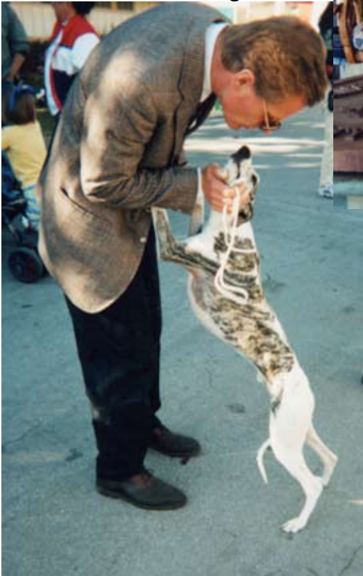
FCI International Champion and World Winner 2006