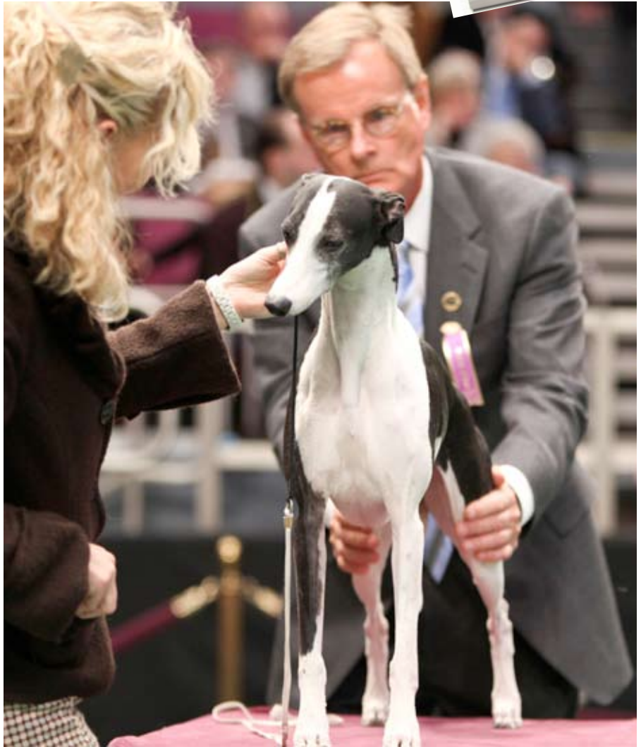
Judging Westminster in 2009

BOB Ch Sporting Fields Glory Bound Ch Sportingfields Hot Topic x Ch Sportingfield Paris N'River Chase